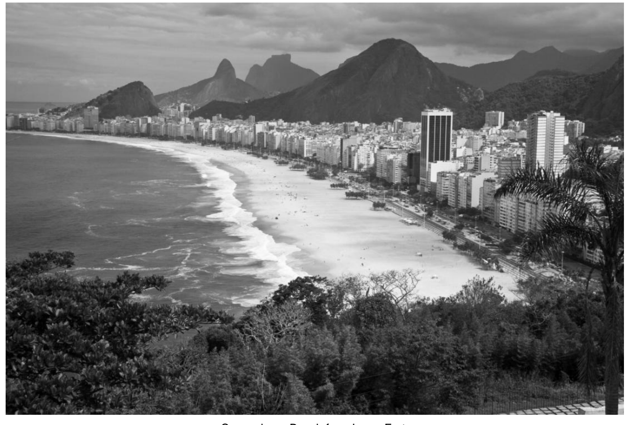
Copacabana Beach from Leme Fort